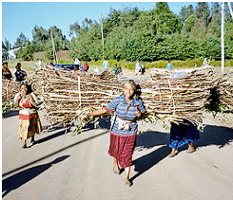
Roger Thurow Fuel-wood carriers of Addis Ababa, Ethiopia

Their pace is a slow, stooped trot, propelled by the weight of the load balanced on their shoulders. The bundles are more than 6 feet wide -- wider than the women are tall. By the time the women reach the city markets, it is dark and they have covered as many as 10 miles on foot. If they are lucky, they will receive top price for their bundle: about 70 cents.