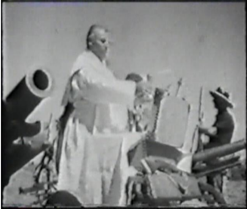
A Vatican Clergy blessing the Italian Fascist Army on its way to commit war crimes in Ethiopia