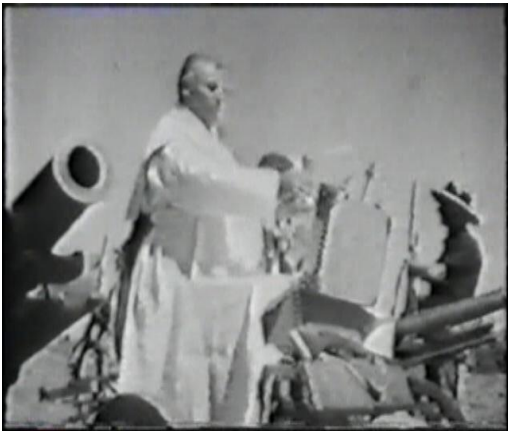
A Vatican Clergy blessing the Italian Fascist Army on its way to commit war crimes in Ethiopia