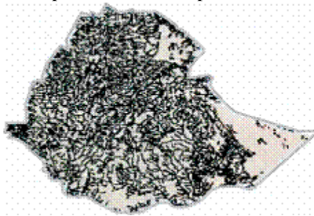
RIVERS OF ETHIOPIA FIG. 3

Eritrea is not an important land by itself. What makes Eritrea important is Ethiopia. Speaking on the merits of economic, social and political values, Eritrea is less important to Ethiopia today than when it was a province of Ethiopia. Djibouti has more superior significance to Ethiopia than Eritrea. Ethiopia has not experienced hardship as the result of Eritrea's separation, but Eritrea has.